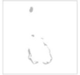
Cocos (Keeling) Islands